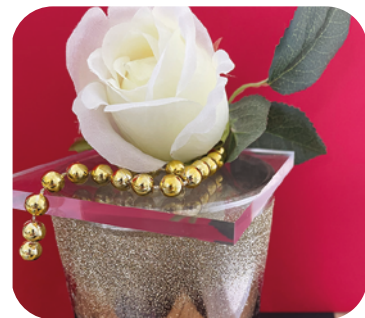
Optimum finish on transparent PMMA